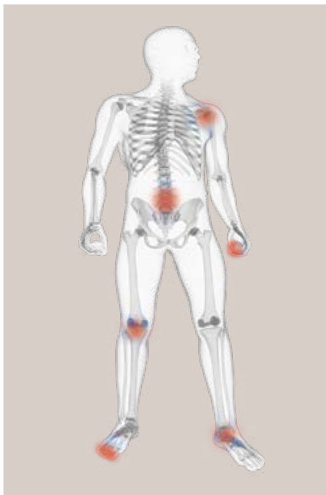
Figure 1. Joints affected in psoriatic arthritis